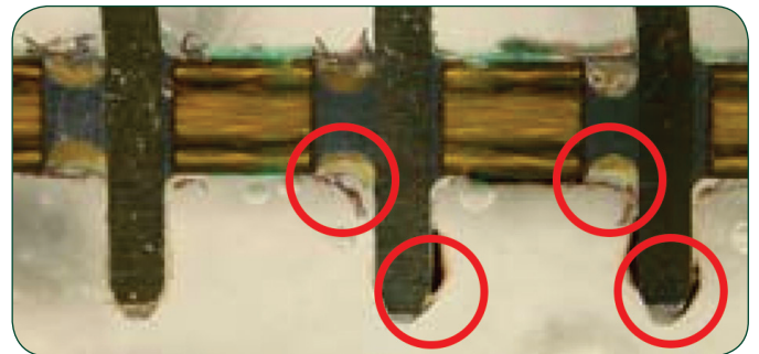
Solder starvation in PIP processed solder joint. Also note the excess residual flux.