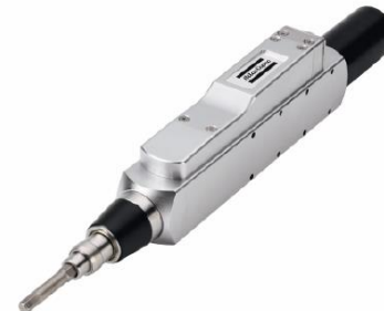
Tensor ES Electric screwdriver