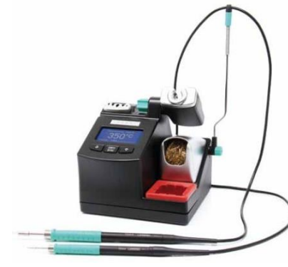
CD Soldering station