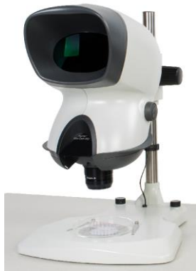
Mantis EliteCam HD