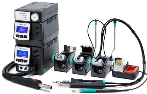
RMST Rework station