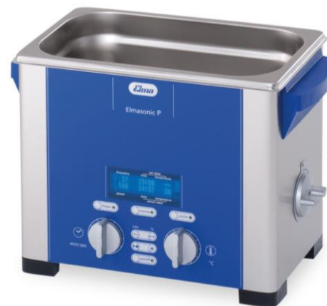
Elmasonic P 30H ultrasonic bath