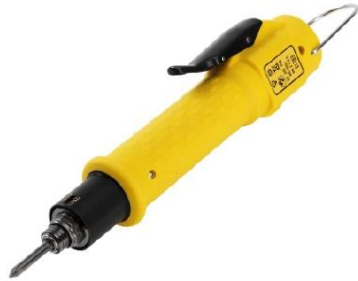
EBL Electric screwdriver